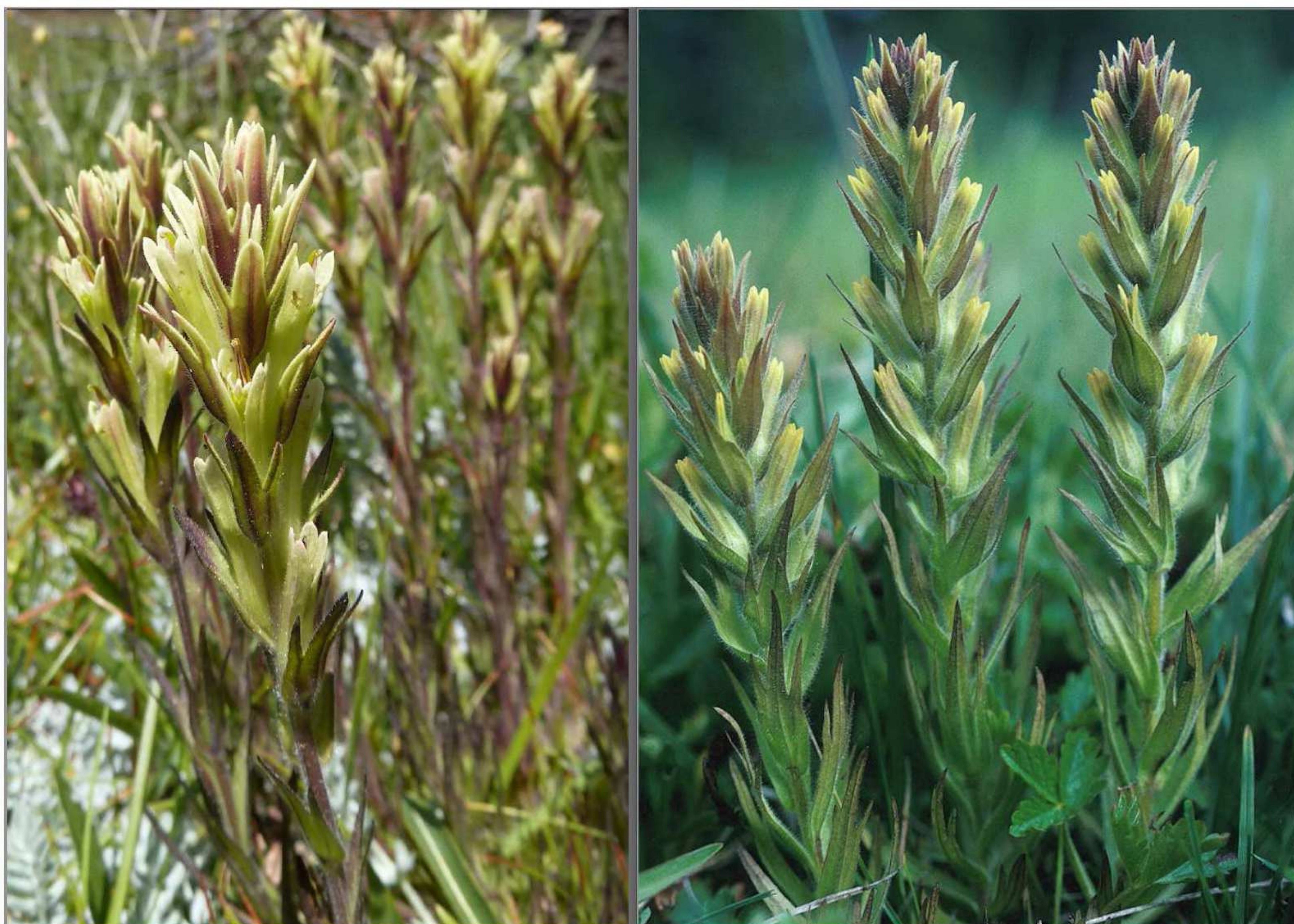
Figure 9. Castilleja collegiorum (left) at Big Meadows, 15 Jul 2013, and Castilleja cryptantha (right) at Berkeley Park, Mt. Rainier National Park, Pierce Co., Washington, 23 Aug 1993.

5. Beak of corollas about twice the length of the lower lip; corolla beaks and lower lips often exerted above the calyces, and/or primary calyx lobes spreading to reveal the distal portions of the corolla; bracts appearing to be shorter than the flowers; leaves narrower and linear-lanceolate; pollination system unknown but likely cross-pollinated by bees; endemic to Big Meadows, Klamath Co., Oregon ..... Castilleja collegiorum